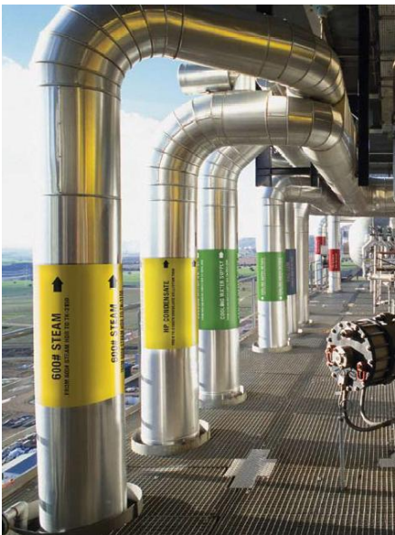
HEAT TRACING / PIPE MARKING