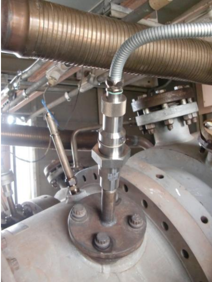
FIBER OPTIC FLAME SCANNER No liquid cooling required