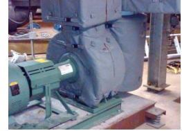
Reusable Insulation Covers