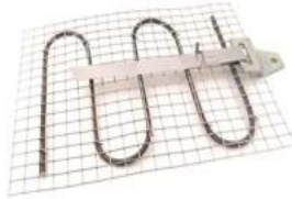
Tank Heat Mats