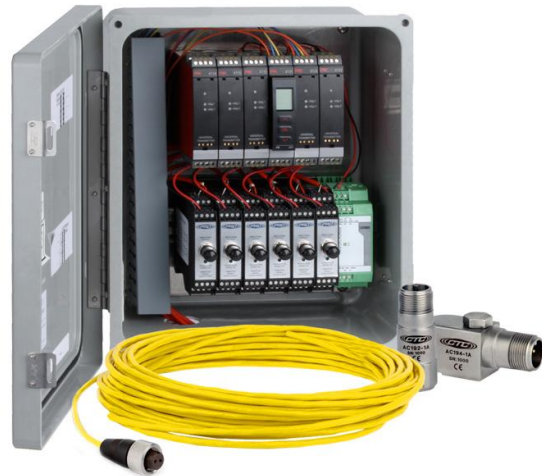
VIBRATION MONITORING 24/7 Protection + Analysis