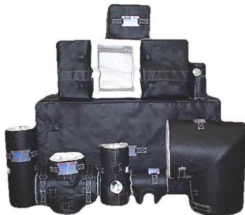
CUSTOM REUSABLE INSULATION